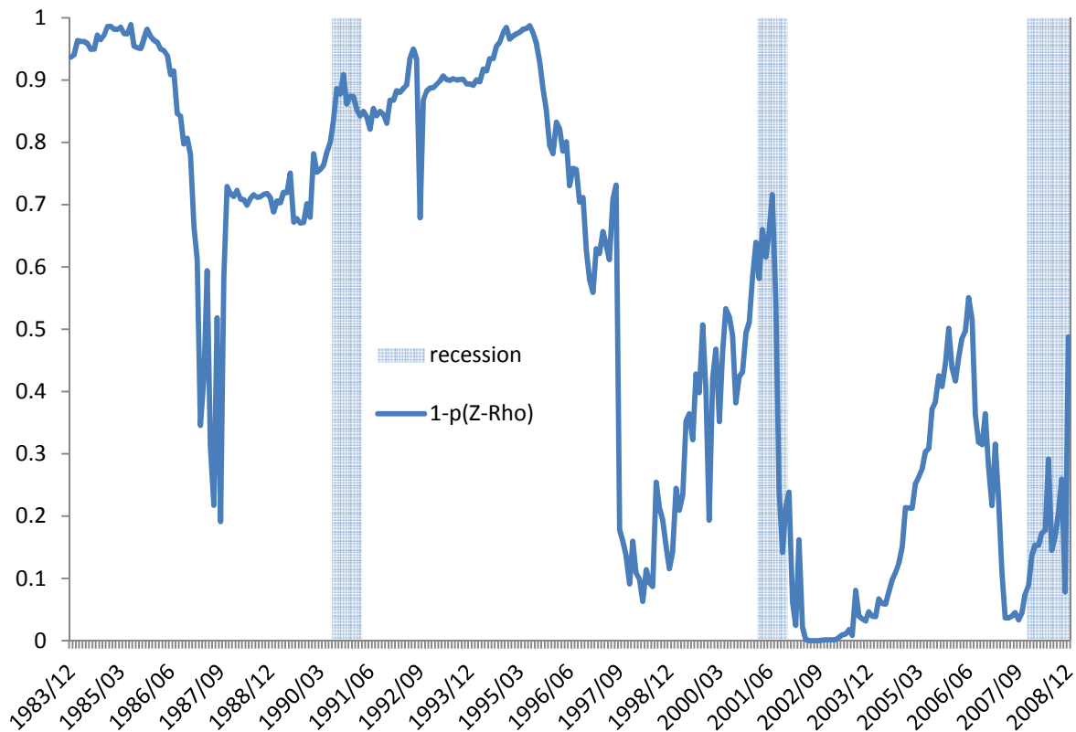
Figure 3. Strength of cointegration between prices and fundamentals using p(Z-Rho)

This graph displays the strength of cointegration between aggregate price and fundamentals where aggregate fundamentals are measured as the V12(TBe) model. The strength of cointegration is measured as 1 less the p-value associated with Z-Rho, where Z-Rho is the test statistic on the adjusted regression coefficient from the Phillips-Perron regressions which test for stationarity. The V12(TBe) model includes 12 forecasts of earnings based on analysts' forecasts for the first two years and a fade rate to the industry median ROE for the remainder, plus a terminal value based on the industry median ROE. The discount rate, r , is the three-year constant yield to maturity T-bill rate plus an equity premium of 6%. Recession is from NBER.