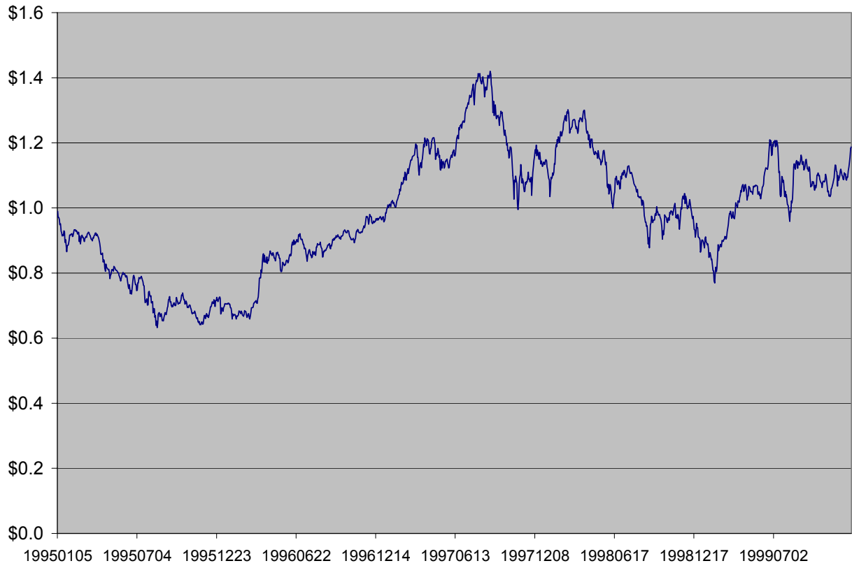
Figure 1: Growth of $NT 1 invested in Taiwan Index on December 31,1994, through December 1999